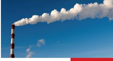
Handbook on N 2 O Mitigation Experience in Germany/Europe